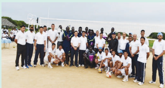
FRIENDLY VOLLEYBALL MATCH WITH STUDENTS OF DR JOHN GARANG MEMORIAL UNIVERSITY