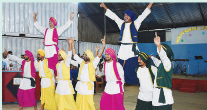
PERFORMANCE OF PERSONNEL OF INDBATT-II DURING CULTURAL EVENT