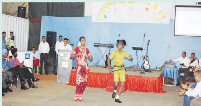
PERFORMANCE OF PERSONNEL OF SRIMED L2 AND NEPPFU DURING CULTURAL EVENT