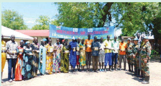
DISTRIBUTION OF SOLAR LAMPS AT AKOBO