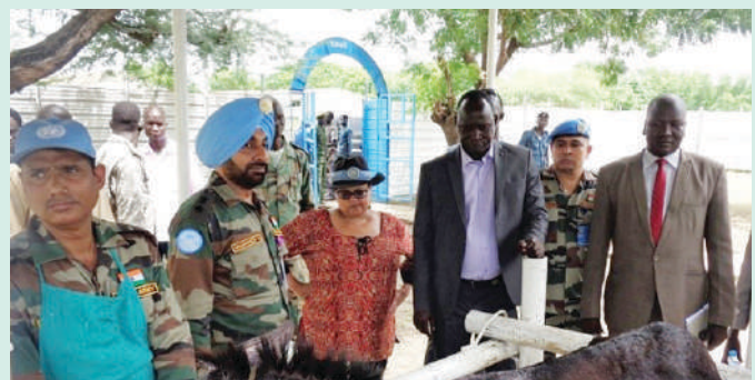
HONOURABLE GOVERNOR AND MINISTER OF ANIMAL RESOURCES INSPECTING TREATMENT ASPECTS