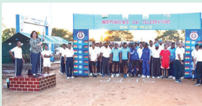
FREEDOM RUN AT BOR CAMP