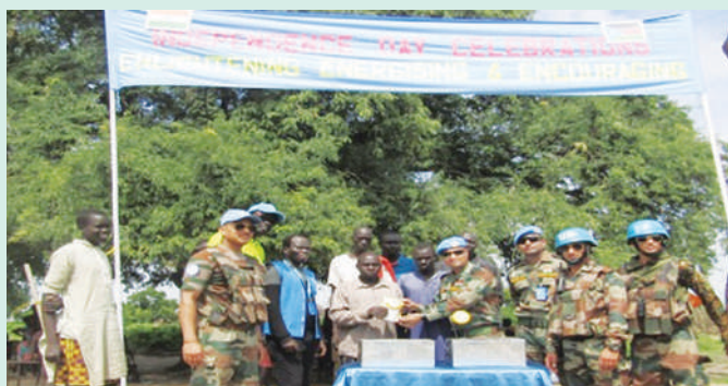
DISTRIBUTION OF SOLAR LAMPS AT MALEK

A Freedom Run was organized on the morning of 15 Aug 19 for staff at Bor field office to strengthen our pledge to serve under a common UN flag. A five KVA generator was presented at Akobo on 15 Aug providing much needed succor to the locals facing water shortage. As part of continued outreach to hinterlands a medical camp was organized at New Fangak by the LDAP on 15 & 16 Aug 19. The gala celebrations climaxed with cultural performances by INDBATT-II, NEPPFU and SRIMED L2 in the evening. The event generated much interest amongst the locals and staffs.