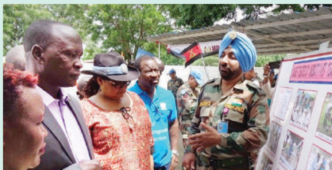
COMMANDER VETERINARY TEAM INDBATT-1 BRIEFING HONOURABLE GOVERNOR ABOUT VARIOUS RENOVATIONS CARRIED IN HOSPITAL