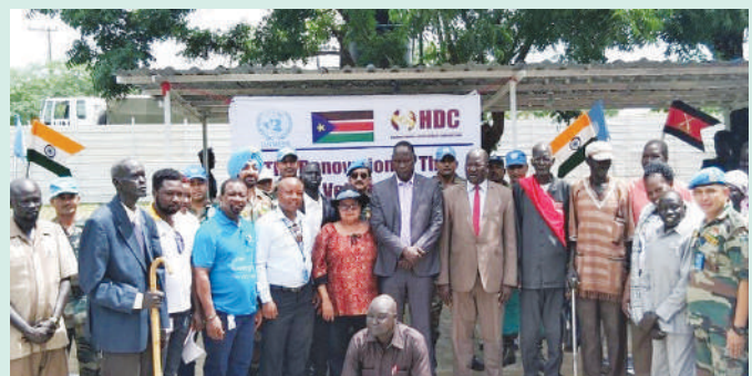
HONOURABLE GOVERNOR OF CENTRAL UPPER NILE STATE GOVERNMENT OFFICIALS, UNMISS STAFF AND LOCALS AT MALAKAL VETERINARY HOSPITAL