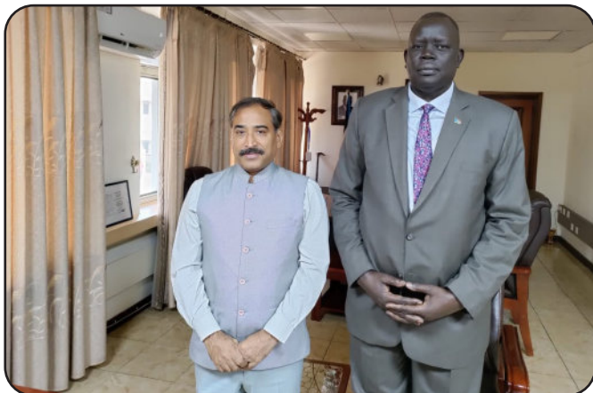
18.12.2022 - With Deputy Foreign Minister. Reviewed progress of bilateral relations and discussed avenues of cooperation during 2023.

16.12.2022 - Met the Central Equatoria State Minister of Housing to discuss issue of allotment of land to Indian community for Hindu temple and cremation ground. Issue of compensation for an Indian national was also followed up.