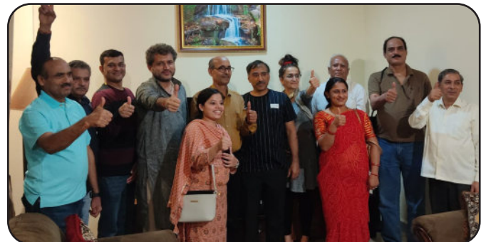
At the success of Jaipur Foot Camp (9 July 2022)