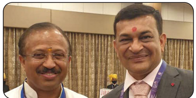
With MoS Mr. V. Muraleedharan in Indore