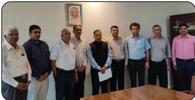
At the Embassy for community welfare issues