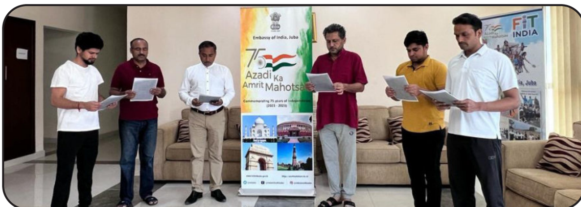
Preamble reading on Constitution Day (26-11-2022)