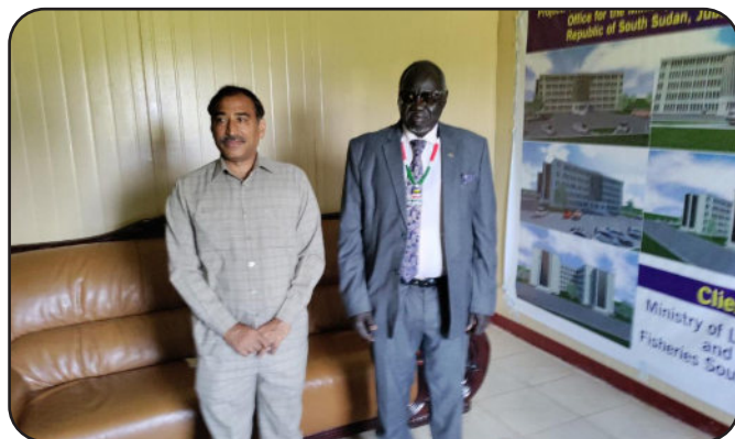
Meeting of Ambassador with Hon. Onyeti Adigo Nyikech, Minister of Livestock & Fisheries of South Sudan