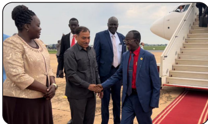
Ambassdor receiving H.E. Dr. James Wani Igga, Vice President after his visit to India in July 2022