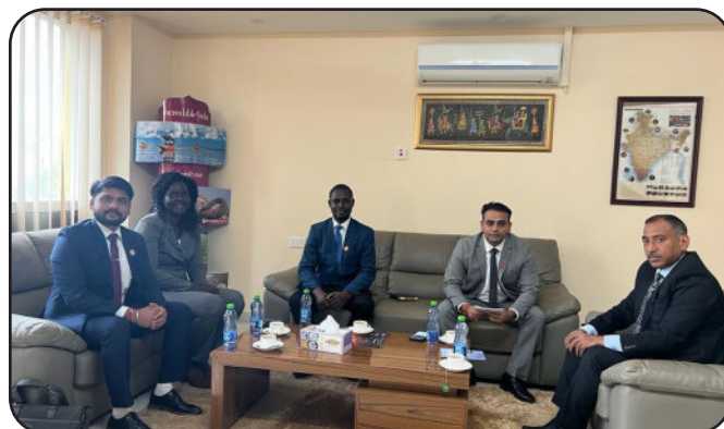
BEACON Diagnostics product launch