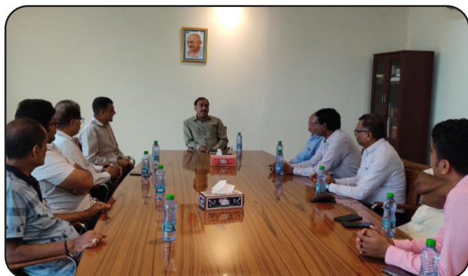
Meeting with Indian Businessmen