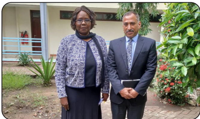
Ambassador's Meeting with Hon. Josephine Joseph Lagu, Minister of Agriculture & Food Security of South Sudan