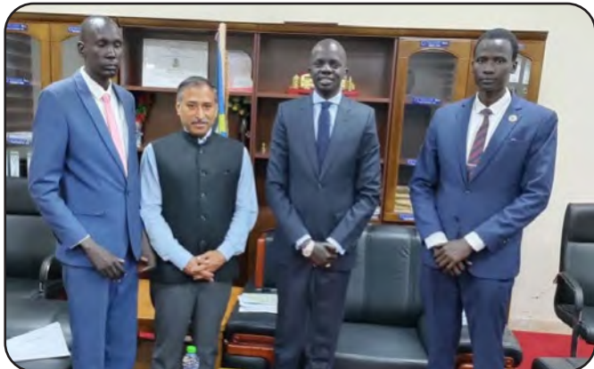
Meeting with Hon'ble Minister of Petroleum

There were a series of bilateral meetings with South Sudanese dignitaries and interaction with diplomats in Juba. The main interactions included meetings with the Minister of Petroleum (on matters related to operation of ONGC-Videsh Ltd), Minister of Humanitarian Affairs and Disaster Management (on Food grain assistance by India), Dy. Foreign Minister (in connection with a Quick Impact Project for digging boreholes at Mangalla IDPs Camp), Deputy Defence Minister (on DefExpo) and Minister of Housing, Land and Public Affairs (to discuss allotment of plot for Hindu temple and cremation ground). There were meetings with Under Secretaries in the Ministry of Agriculture, Investment and Director General of Trade and Industry for exploring areas of new cooperation and promotion of bilateral trade between India and South Sudan. There was also a fruitful meeting with the Under Secretary in the Ministry of Environment for the membership of South Sudan in the Coalition for Disaster Resilient Infrastructure.