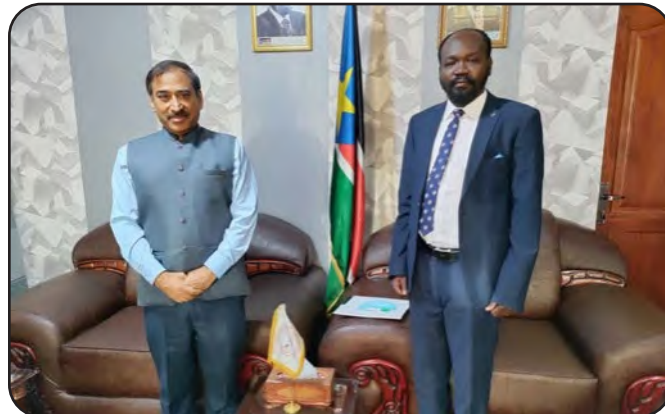
Meeting with Hon'ble Minister of Humanitarian Affairs and Disaster Management