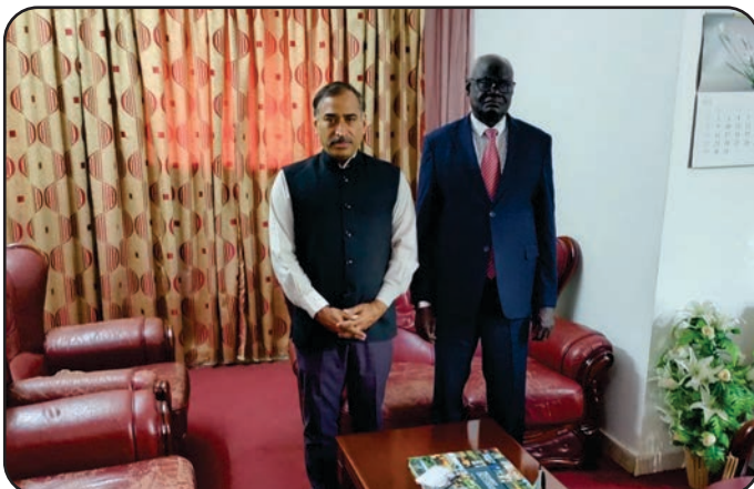
With Minister of Higher Education, Science & Technology