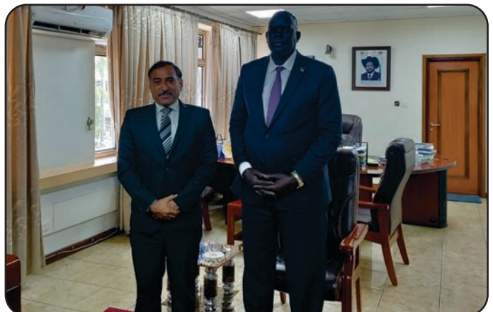
With Dy. Minister of Foreign Affairs & International Cooperation