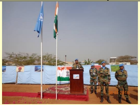
<u>Jan 2016</u>: National Senior Brig Gen. Bimal Rattanpal speaking during Flag hoisting event at UN Compound on Republic Day