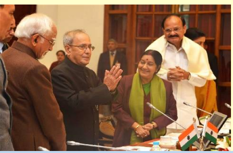
At Conference of Governors on February 10