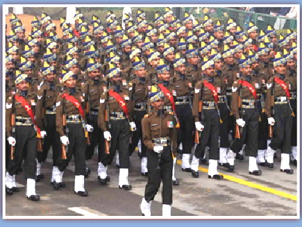
The Corps of Signals marching contingent