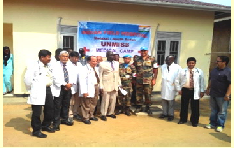
<u>July 2013</u>: Medical Camp in Juba organised by IndBat (Malakal Indian Field Hospital), Indian Association & Indian Embassy