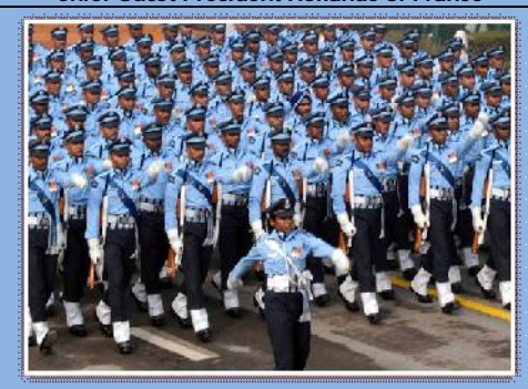
Air Force marching contingent