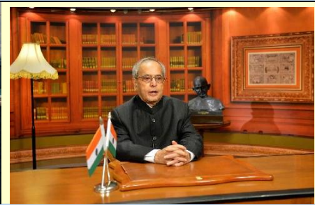
Republic Day on January 25, 2016.