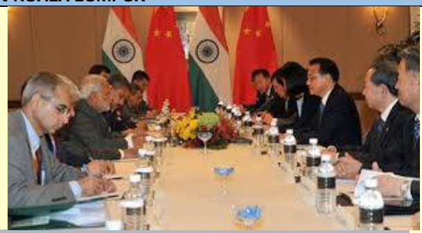
PM met Chinese Premier Li Kequiang on 21 Nov during a bilateral meeting on sidelines of the Summit