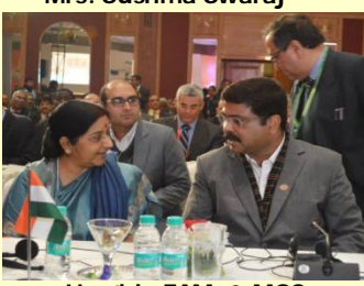
Hon'ble EAM & MOS