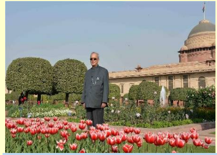
President at the opening of Mughal Garden at Rashtrapati Bhavan-February 11