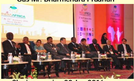
Closing session 22 Jan 2016