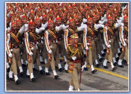
The RPF marching contingents