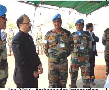
Jan 2016: Ambassador interacting with India's National Senior and IndBat personnel at UN Compound on Republic Day