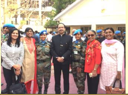
Reception hosted by India's National Senior in UNMISS on January 26, 2016