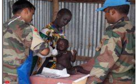
<u>July 2013</u>: IndBat personnel hold free medical clinic in Pibor, Jonglei State