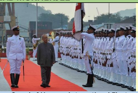
Guard of Honour: International Fleet Review-2016 at Visakhapatnam on February 6