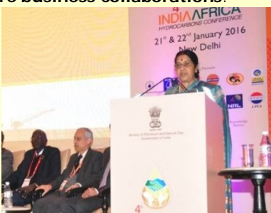
Hon'ble External Affairs Minister Mrs. Sushma Swaraj