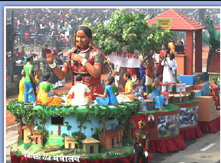
Tableaux pass through Rajpath

"Beating the Retreat" Ceremony at Vijay Chowk New Delhi on January 29, 2016