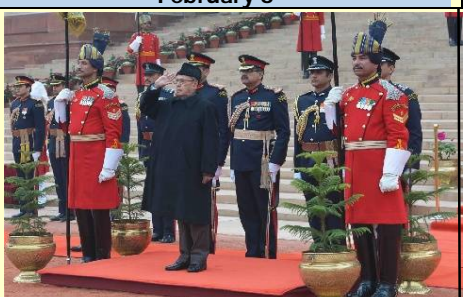
Taking Salute from President's Body Guard before 'Beating Retreat' ceremony on Jan 29