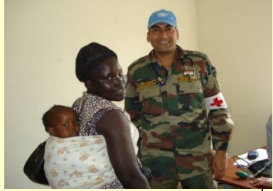
July 2013: Medical Camp in Juba -Malakal Indian Field Hospital), Indian Association & Indian Embassy