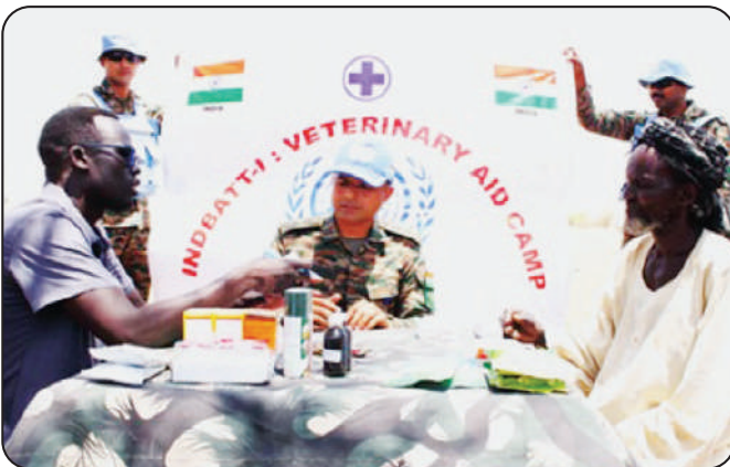
EXTENDING SERVICES, CONSULTATION AND DRUGS TO REFUGEE AND RETURNEE HERDSMEN