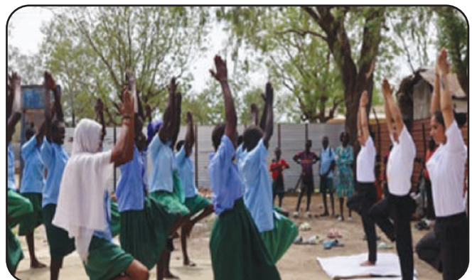
FEMALE ENGAGEMENT TEAM ENLIGHTENING YOUNG MINDS TOWARDS SPIRITUAL AND PHYSICAL WELLBEING: YOGA FOR ONE EARTH, ONE HEALTH