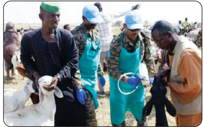
MASS DEWORMING IN PROGRESS