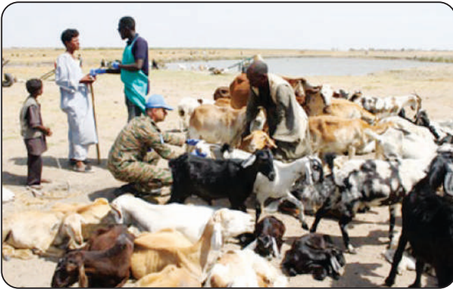
CLINICAL ASSESSMENT OF THE HERD AT EL GEIGER