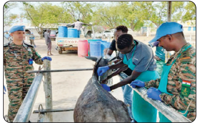
ON THE JOB TRAINING AND DISTRIBUTION OF ROUTINE FIRST AID MATERIAL TO COMMUNITY ANIMAL HEALTH CARE WORKERS FOR ATTENDING ROUTINE CLINICAL CASES AT MALAKAL VETERINARY HOSPITAL