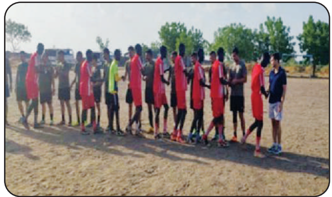
FRIENDLY FOOTBALL MATCH BETWEEN LOCAL YOUTH AND INDIAN TROOPS AT RENK COB