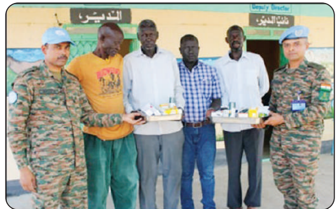
TECHNICAL DISCUSSION AND PRESENTING OF ESSENTIAL FIRST AID MEDICATION