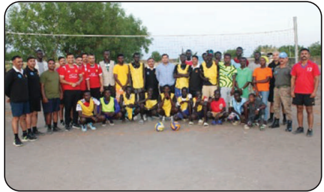
FRIENDLY VOLLEYBALL MATCH BETWEEN INDIAN CONTINGENT AND BUDDING PLAYER FROM YOUTH OF LOCAL COMMUNITY AT RENK TRANSIT CENTRE